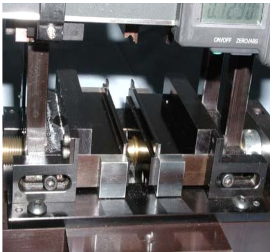
FP-2MAS Bottom Tooling Shown

The tooling is typically fabricated with O1 tool steel. Machined and ground in our own manufacturing facility, the FP-2MAS die is electroless nickel plated, ensuring durability.